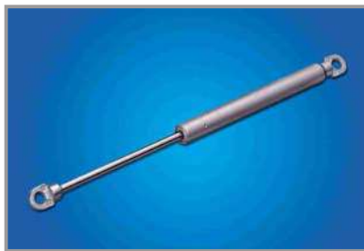
氣壓棒 Air Cylinder