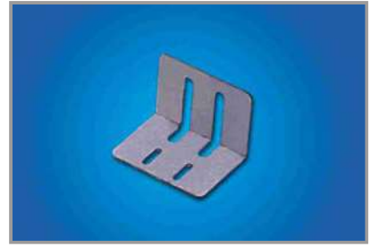
微動開關固定座 Universal Bracket