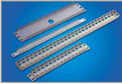
支架 Support Bracket