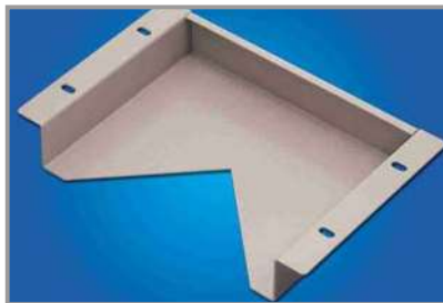
文件夾 File Box