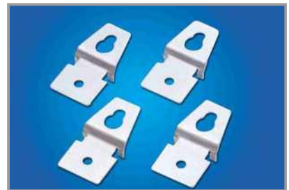
壁掛片 Wall Fixing Bracket