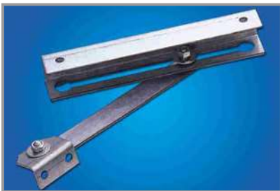
門擋片 Door Stay