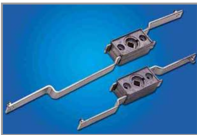
連動式鎖網 Safety Lock