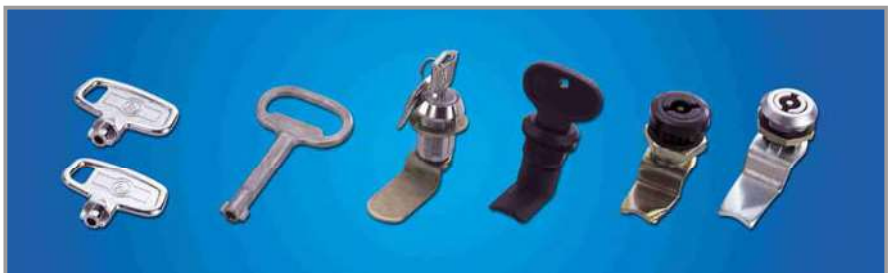
鎖組 Lock Accessories

各種零件可自行搭配選購。 All accessories can be purchased depending on the needs of customer