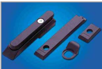
鎖裝飾板 Door Handle System